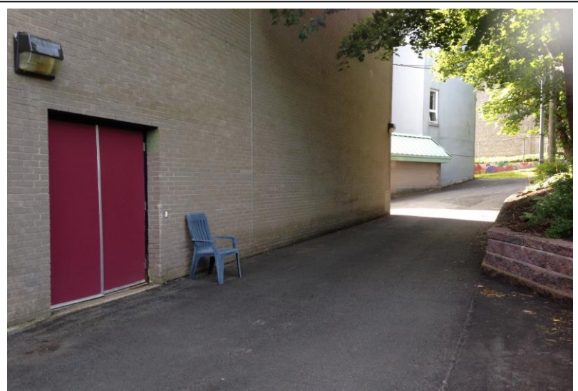
Entrance facing Mullock Street