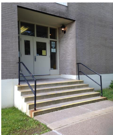
Entrance on Barnes Road

No automated button, but door bell that alerts office staff